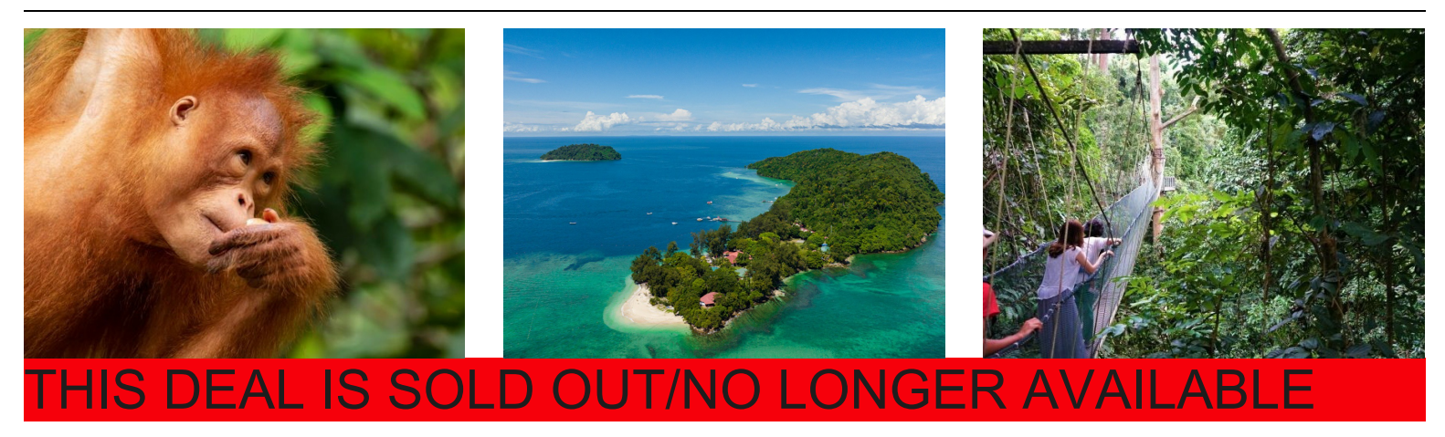
Embark on an extraordinary 10-day odyssey that promises to unfold the enchanting tapestry of Borneo and Malaysia before your eyes.

This immersive journey will sweep you through the very heart of these captivating regions, offering a rich symphony of natural wonders, encounters with exotic wildlife, and deeply immersive cultural experiences that will undoubtedly captivate your senses.